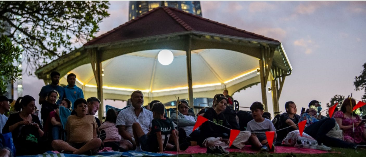
Photo: Families sit on Observatory Hill on Sydney New Year's Eve 2022.